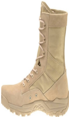
Bates Zero Mass Desert – Wolverine Warrior leather