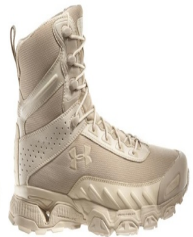
Under Armour Valsetz – 7 inch, synthetic