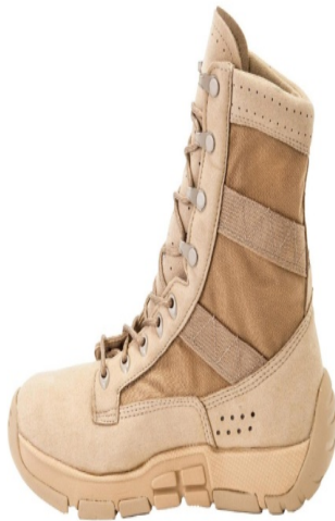
Rocky C4T – synthetic suede