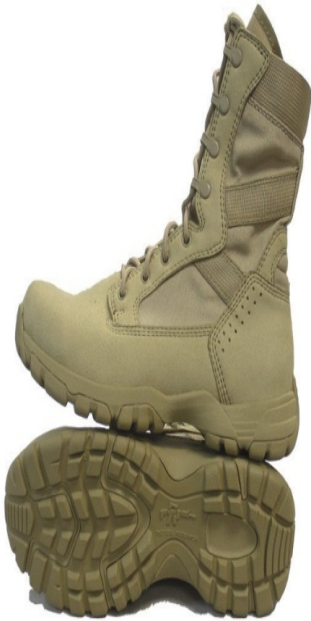
Tactical Research Flyweight Boots – micro suede