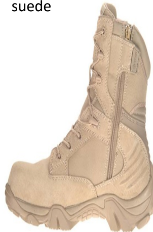
Bates GX-8 Desert Composite – Wolverine Warrior leather & zipper