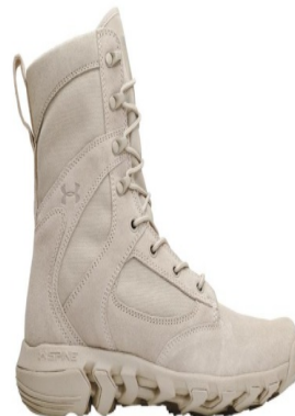
Under Armour Alegent – synthetic