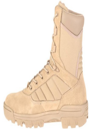
Bates Tactical Sport Desert – Wolverine Warrior leather