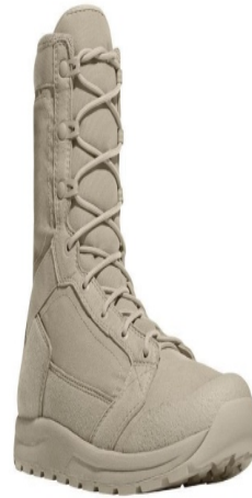
Danner Tachyon – synthetic upper