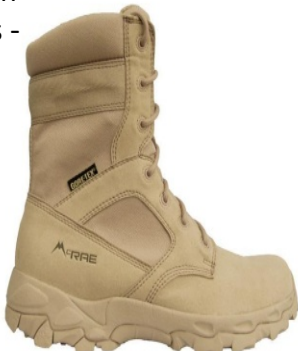
McRae Temperate Ultra Lightweight – synthetic suede

This is not an all inclusive listing. These are boots known to be outside of regulatory guidance. Any boots that do not meet the criteria on the previous slide remain unauthorized to be worn by U.S. Army Soldiers IAW DA PAM 670-1.