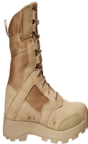
New Balance OTB – synthetic suede