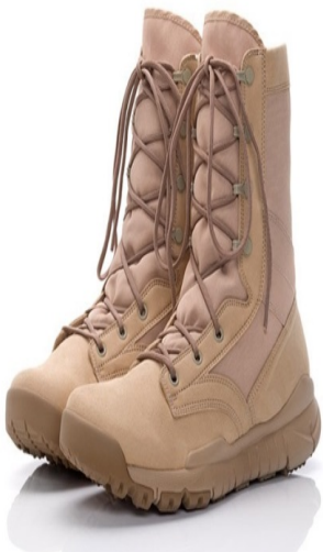
Nike SFB – synthetic leather